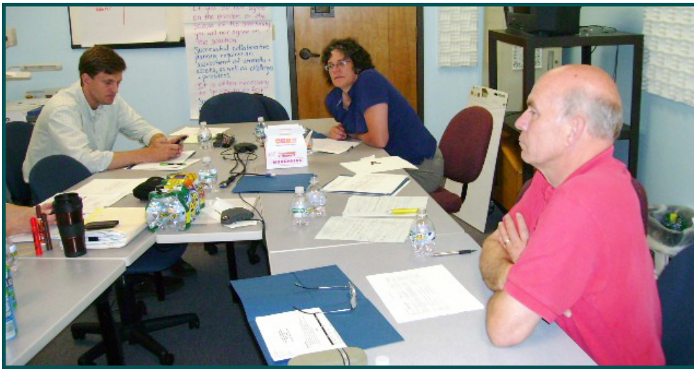
York County Collaborative members review the guiding principles and practices of the network at every meeting.

local enthusiasm MYTC had hoped to generate had not taken hold.